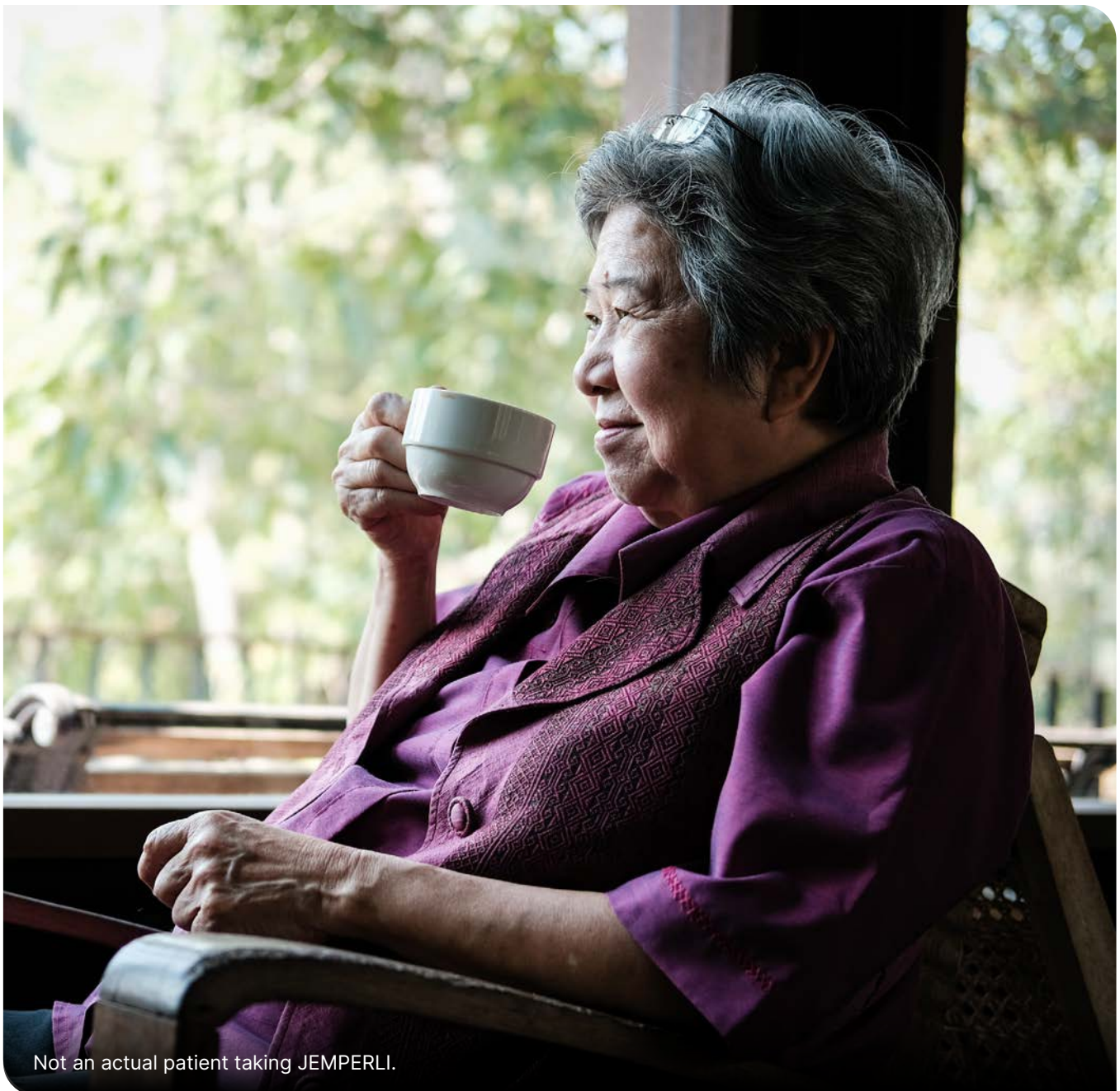
Not an actual patient taking JEMPERLI.